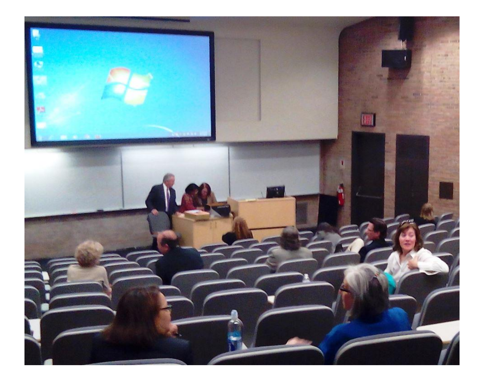
EXHIBIT K. Photographs of Tellers at the Podium during the election